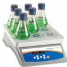
Standard / Advanced Multi-Position Stirrers