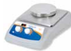
Advanced Round Top Hotplate-Stirrers