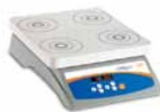
Standard / Advanced Slow Speed Stirrers 4 Position / 10L