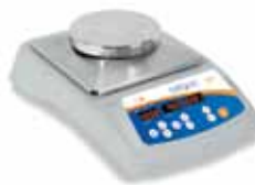
Professional Round Top Hotplate-Stirrers