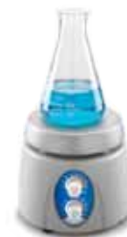
Basic Mini Hotplates, Stirrers & Hotplate-Stirrers