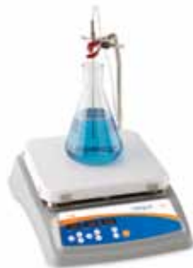
Professional Hotplates, Stirrers & Hotplate-Stirrers