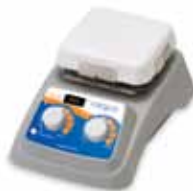
Advanced Hotplates, Stirrers & Hotplate-Stirrers