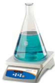
Standard / Advanced High Volume Stirrers