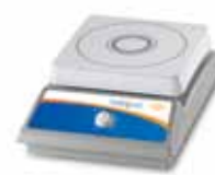
Standard / Advanced Slow Speed Stirrers 1 Position