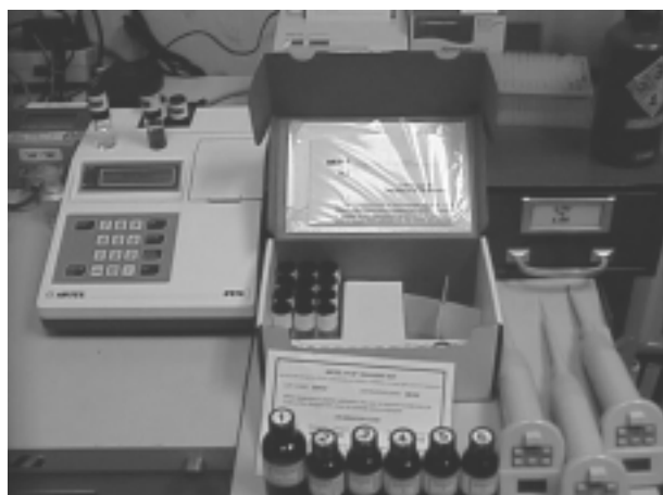
Figure 4. Artel PCS®3 Pipette Calibration System.

which of the 6 ranges of dye are being used and the volume being measured. The reagent costs are progressively higher for the larger volumes. The volumes that can be calibrated range from 0.1 to 5,000 \mu\text{l} .