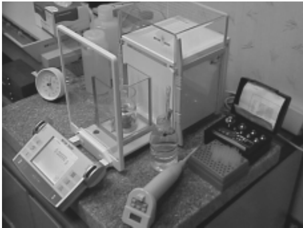
Figure 1. Gravimetric Pipette Calibration System.

gravimetric measurements used to calibrate or verify pipette accuracy and precision.