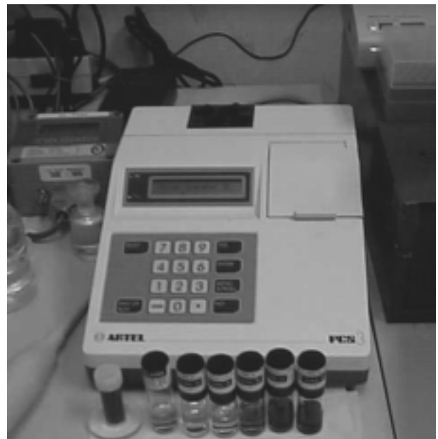
Figure 2. Artel PCS®3 Pipette Calibration.

The total measurement uncertainty of the pipette volumes involves multiplying the standard uncertainty by a k value to quantify the level of confidence for the total