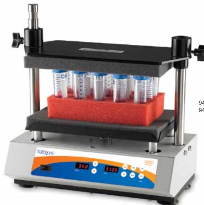
945065 with 945075

One piece housing design optimizes clean-ups. Ideal for applications requiring accuracy and repeatability. The stainless steel one piece housing design is conducive to keeping your vortexer clean and free from contaminants.