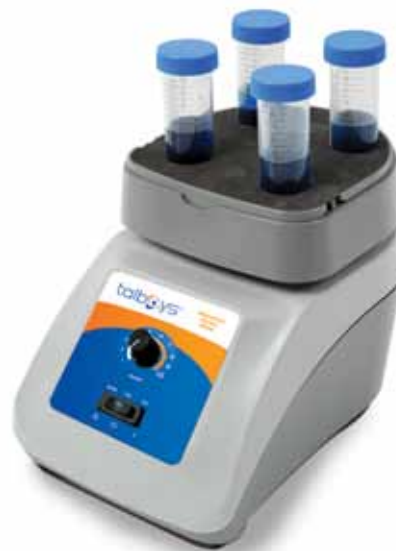
9456TAHDUSS with 9456TAT2629

Mixer includes a cup head, universal holder with cover, foam microtube insert for (38) 1.5 to 2.0 mL microtubes, and a 92" (234cm) detachable, 3-wire cord and specified plug. Additional accessories can be found on page 84. 5 year limited warranty on parts and labor.