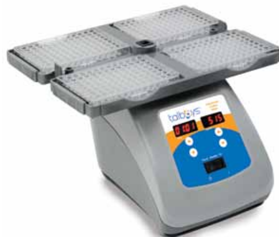
9456TAHDUSA with 9456TAMPLT4

The Talboys Advanced Heavy-Duty Vortex Mixer is ideal for applications that demand repeatable results. Mixer features touchpad controls and LED displays for accurate speed (rpm) and time (minutes and seconds) results. The heavy-duty design and efficient motor allow this mixer to operate in continuous duty and handle all accessories over the entire speed range. Choose from two modes of operation: "Touch" mode for mixing tubes when cup head or Universal Holder with cover is depressed, or "On" mode when using any of the accessory attachments for continuous operation. Microprocessor control maintains set speed for strong, consistent mixing action. Timer will display elapsed time or, when programmed to user defined time limits, the unit will shut off when time reaches zero.