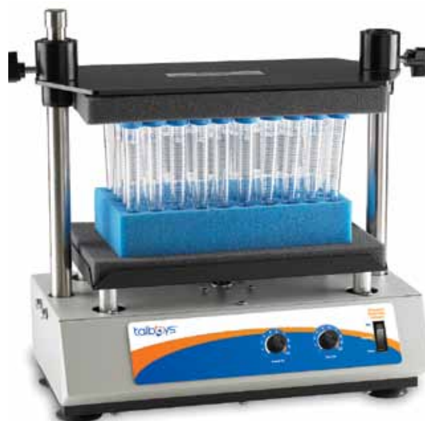
945007 with 945072

One piece housing design optimizes clean-ups. Ideal for applications requiring accuracy and repeatability. The stainless steel one piece housing design is conducive to keeping your vortexer clean and free from contaminants.